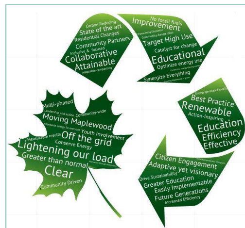
Figure 2. Maplewood Energy Vision

The final energy vision states that Maplewood's energy action plan will: